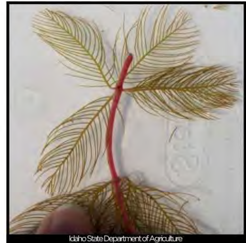
Idaho State Department of Agriculture